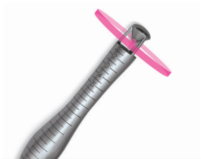
Ladylift Vaginal Handpiece.