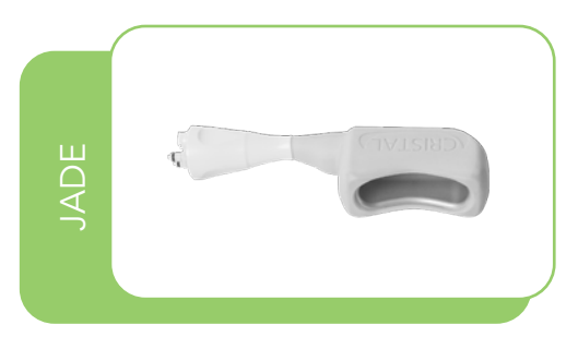
Small to medium fat folds for body <u>Indications</u> : Bra folds, arms, knees, calves