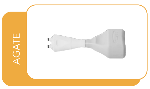
Very small fat folds for face <u>Indication</u> : Chin

The goal? To offer 360° coverage of the silhouette for optimized results and maximum patient satisfaction.